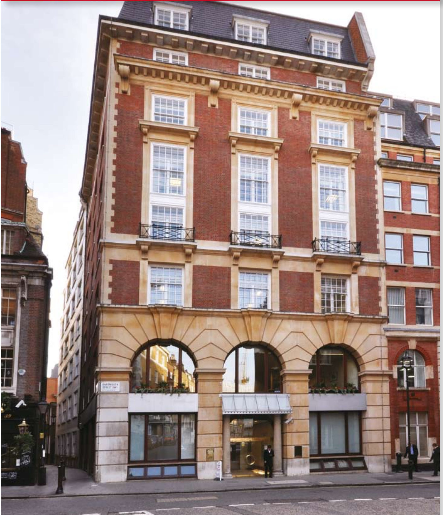
2 QUEEN ANNE'S GATE BUILDINGS, DARTMOUTH STREET, LONDON SW1