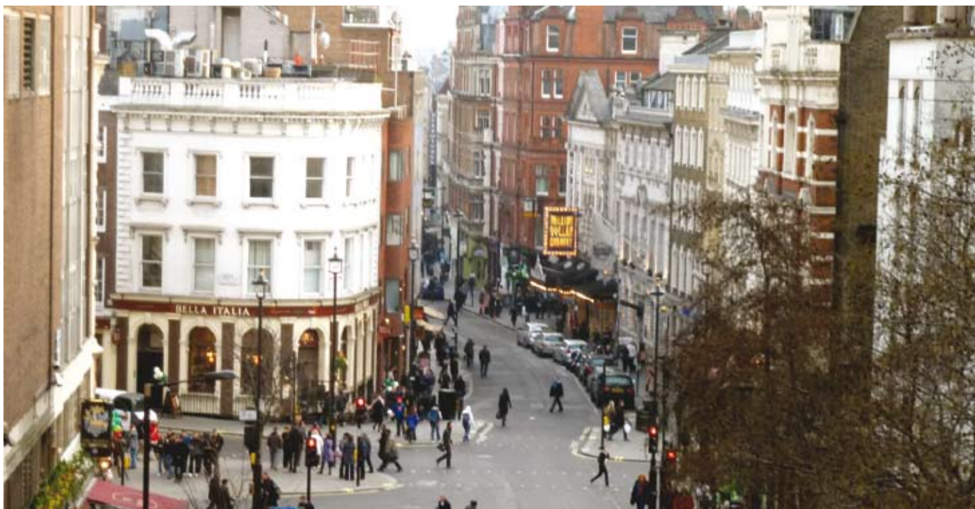
View from the Office